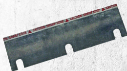
8" FLEX SCRAPER BLADE Part# 28030 (Pack of 5)