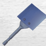
6" SCRAPER BLADES Part# 27035 / Pack of 5 Blade adapter required Part# 27034