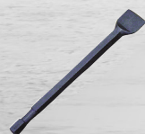
2" STEEL CHISEL Part# 27031