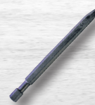
CHIPPING POINT Part# 27037