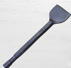
3" STEEL CHISEL Part# 27033