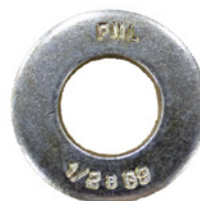
FNL Spacers CG227 Part #:12230