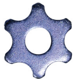
6-Point Blue Carbide Cutter CP206-T Part #:20156