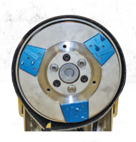
SINGLE DISC GRINDER W/LEFT-HAND TOOLING

DYMA-PCD W/BACKING SEGMENT Directional Tool