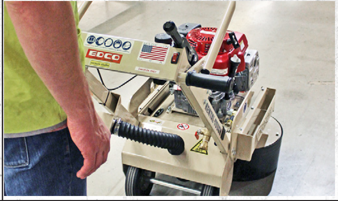
OPERATOR POSITION w/DUAL-DISC GRINDER (FROM HANDLEBARS)

Left and Right-Hand refers to the direction of the disc/tooling rotation when standing in the Operators Position (From Handlebars).